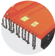
Chain For Safety