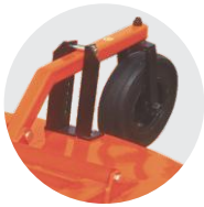
Tyre Assembly For Depth Control