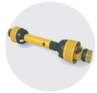
PTO Shaft with Overload Protection