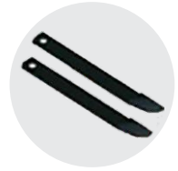
Highly Durable Long Lasting Blades